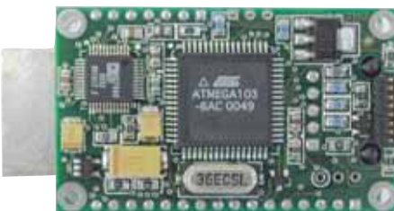
M15HP (shown actual size)