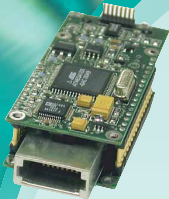
Model 15HP (larger than actual size)

The M15HP has a 5 pin connector containing a bi-directional TTL serial interface for communication, pulse beep, power, and ground. The serial output transmits status, oxygen saturation, pulse rate, plethysmographic waveform, two digitized spare analog channels, and control parameters.